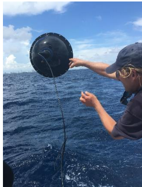
Drifter deployment aboard D/Y Forget About It into the Gulf Stream near Miami, Florida

Since its inception in 2014, the SeaKeepers DISCOVERY Yachts Program has grown significantly. To date, the DISCOVERY Yacht Fleet has completed 28 scientist-led expeditions, ranging from work in the Caribbean to the U.S. West Coast; 39 instruments have been deployed globally from the Mediterranean to French Polynesia; and, 12 educational day trips with school groups and youth organizations in the U.S., Bahamas and Singapore have occurred.