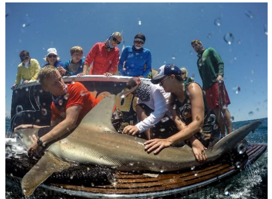
Shark Tagging with University of Miami’s Shark Research and Conservation aboard Fleet Miami’s D/Y Shredder