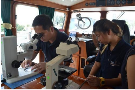
Educational Outreach Program aboard D/Y Lady Jo with Deyi Secondary School in Singapore

The International SeaKeepers Society promotes oceanographic research, conservation and education through direct involvement with the yachting community.